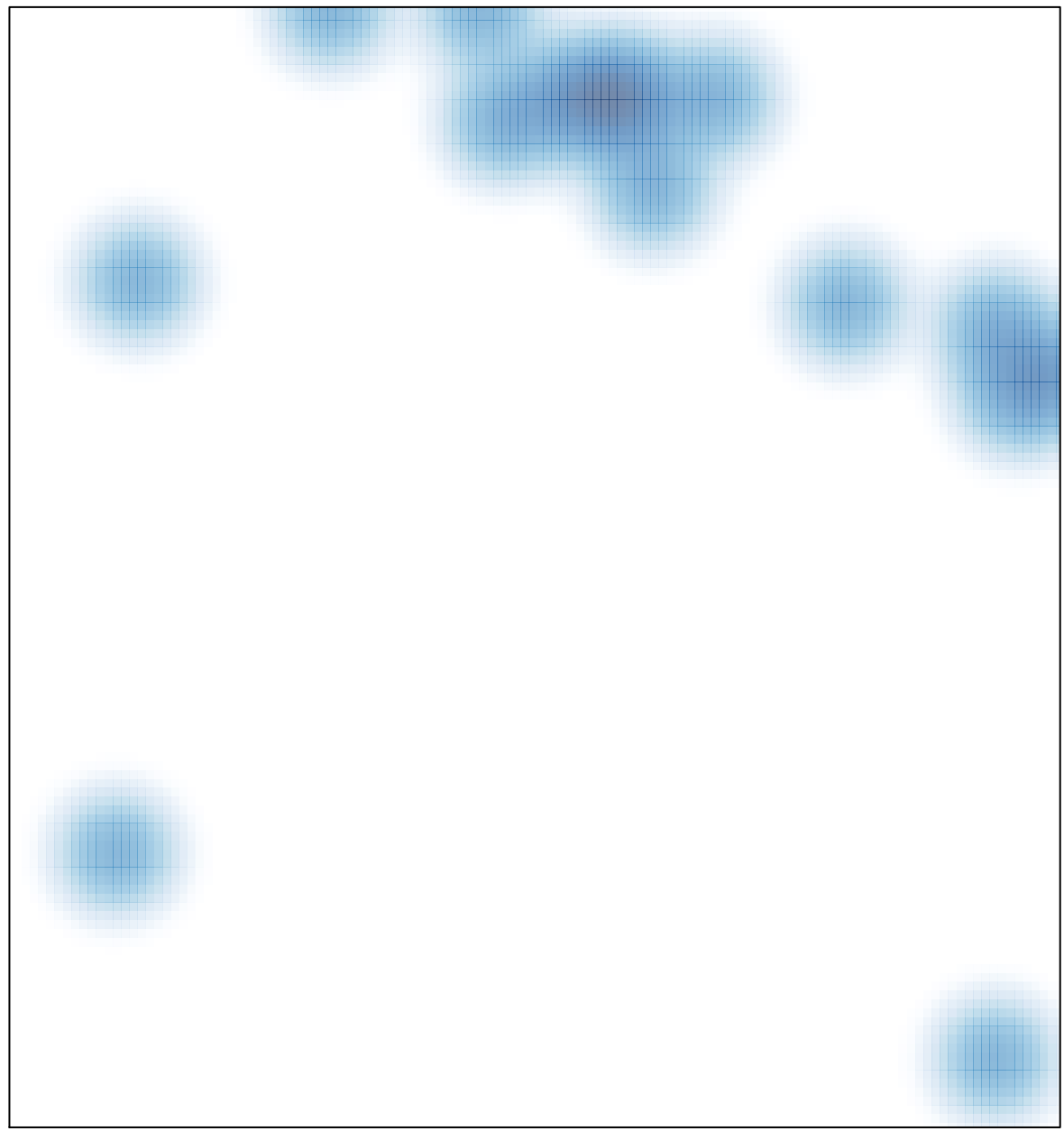
# features = 15, max = 1